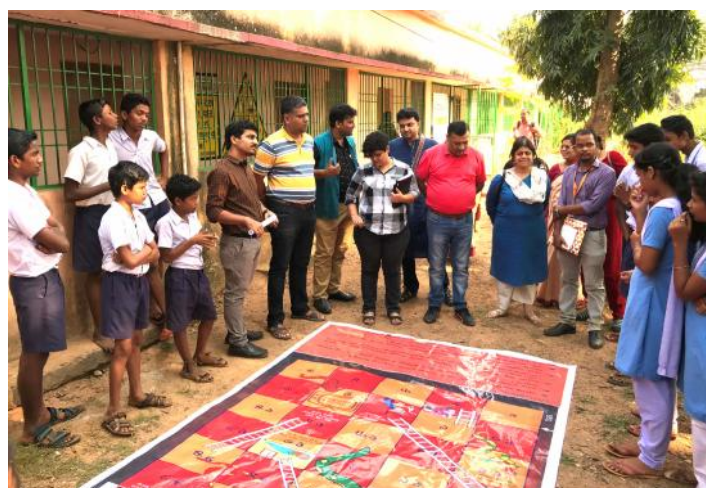
Formation of School Eye Health Club