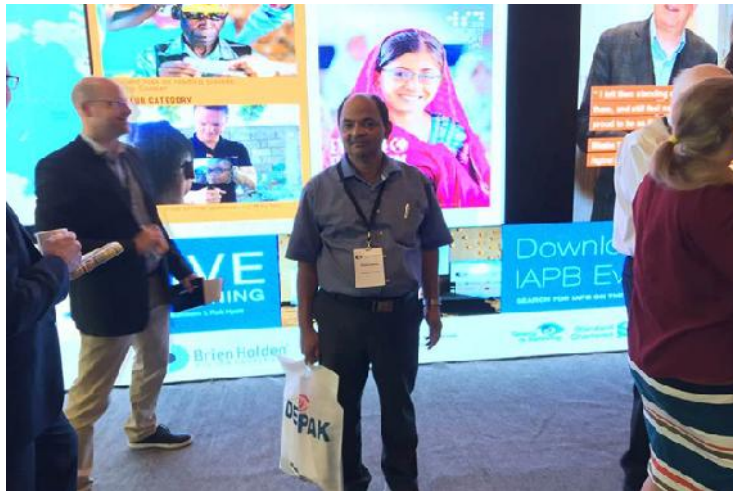
Represented IAPB Meeting by Founder Chair