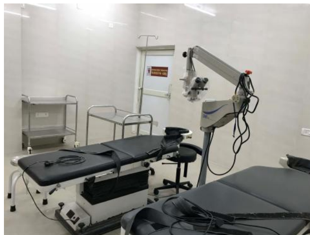
The new OT at Govindpur