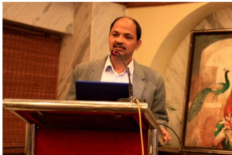
Gathering of Global Health Conference