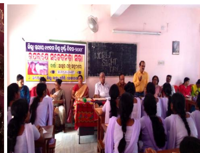
Observation of World Sight Day