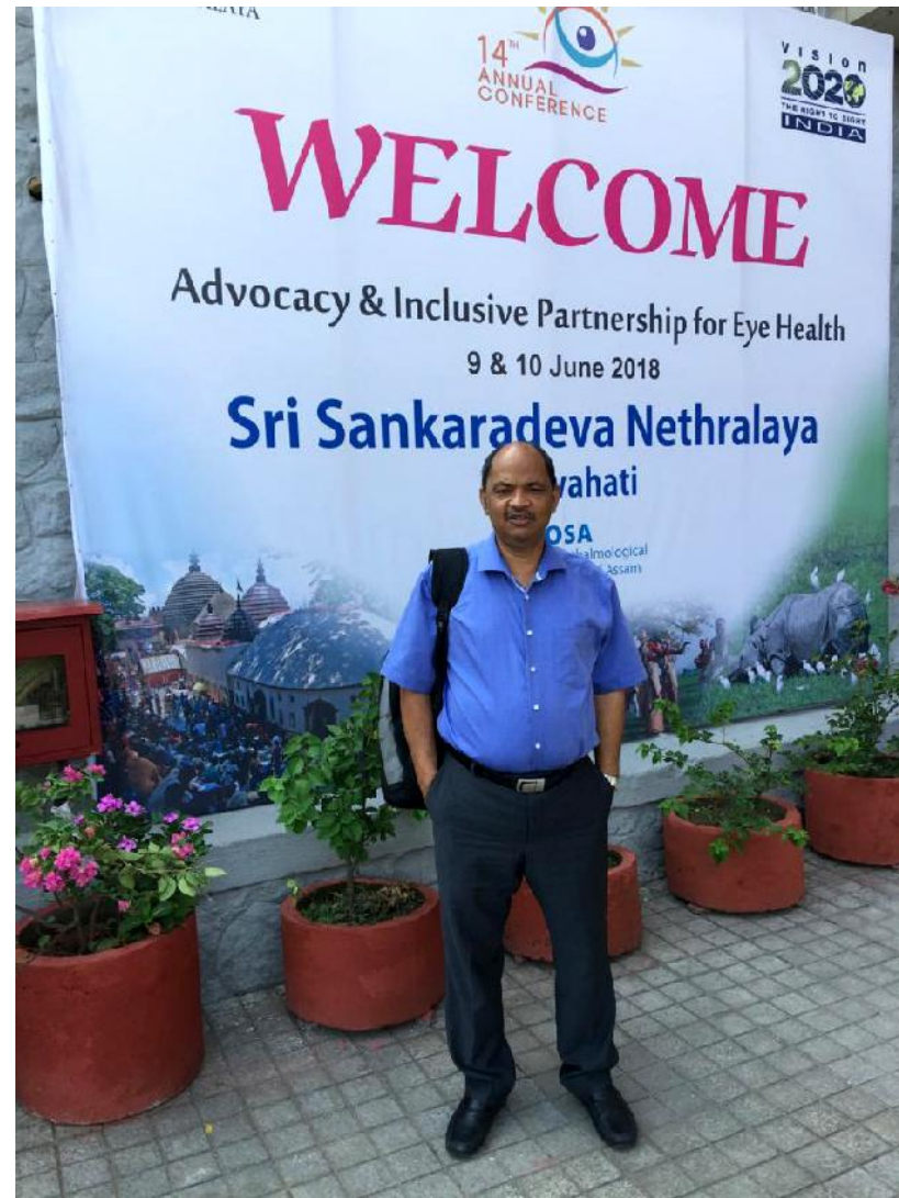
Vision 2020 Meeting by Founder Chair