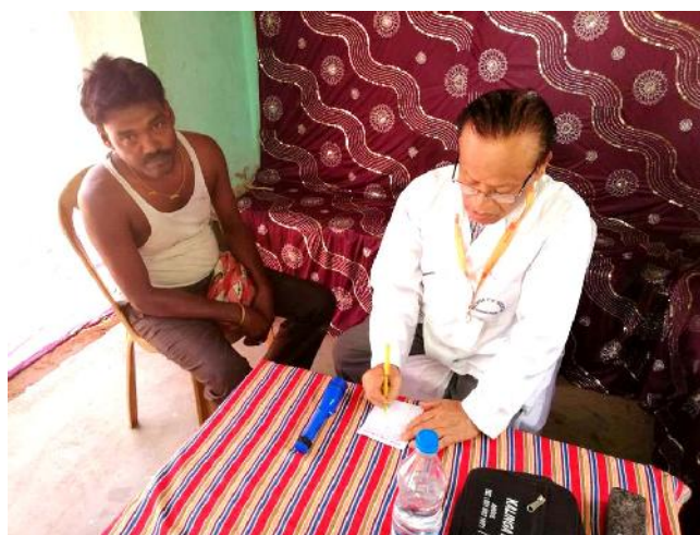
Eye Camp on Road Safety Week