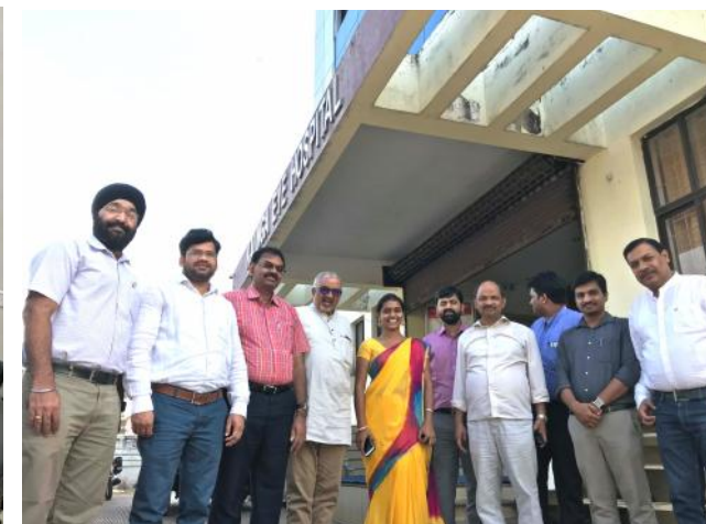
Visit of an expert team to see the School Eye Health Programme.