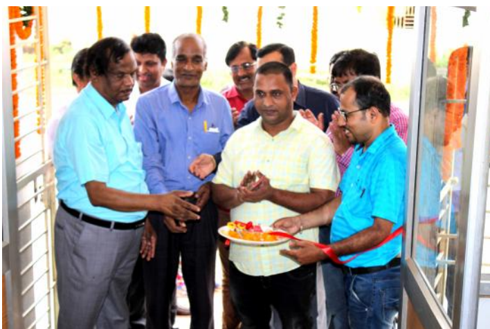
Inauguration of the renovated Eye OT at SDH, Kamakshyanagar