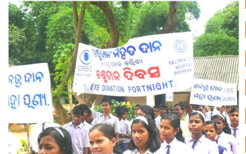
The road show by the school children of Saptasajya High School, Dhenkanal

to burn, or bury them. Eyes can change lives, as they have life, Please save them to donate them.