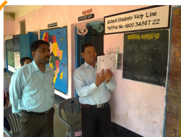
School Eye Screening camp at Batagaon UP School, Kankadahad, Dhenkanal

Uncorrected refractive errors are an important cause of visual impairment in many countries. In developing countries, however, it is often difficult to provide an efficient refraction service