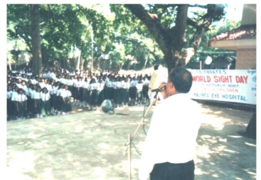
Children of B B High School, Dhenkanal are addressed