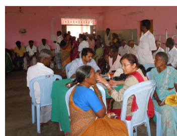
Community Eye Screening camp at Birasal village of Dhenkanal

1988 people were screened in the camp and 287 people were identified with cataract and were transported for surgery.